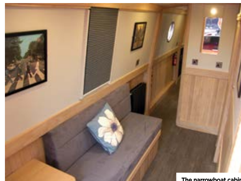
The narrowboat cabins have sofas that convert into double beds.

nemoNOO is the company's newest addition. The eight-berth wide-beam has been built to the same exacting standards as the two narrowboats on a modified Tyler Wilson shell – a larger-than-average rear deck with steering wheel controls allows for an extra outside seating/dining area. It has