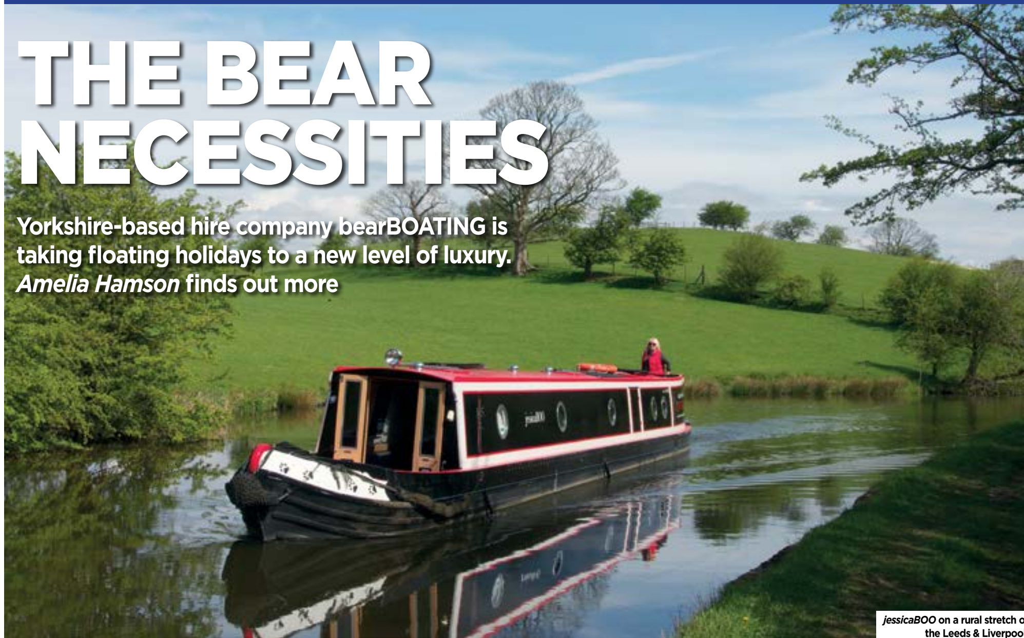
jessicaBOO on a rural stretch of the Leeds & Liverpool.

Yorkshire-based hire company bearBOATING is taking floating holidays to a new level of luxury. Amelia Hamson finds out more