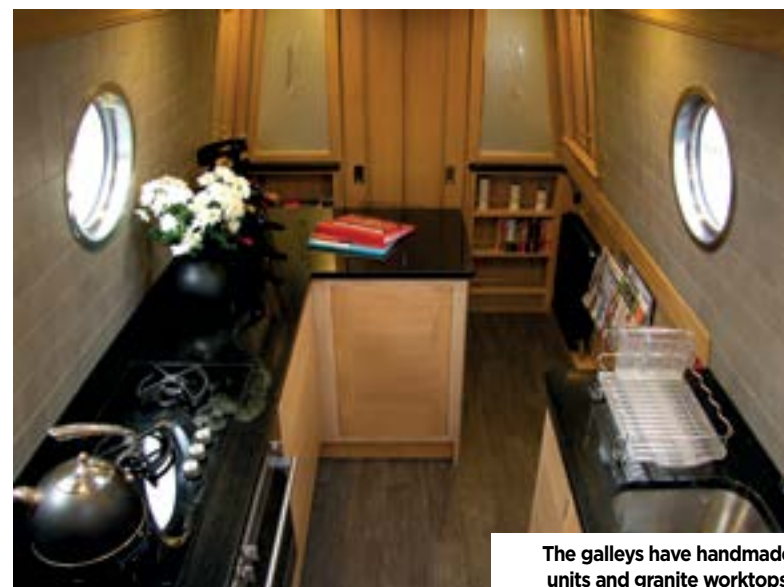
The galleys have handmade units and granite worktops.

jessicaBOO and mollyMOO are both four-berth, 57ft narrowboats with a Tyler-Wilson shell. Their interiors have a reverse layout and are finished to a high standard with bespoke, hand-built oak furniture and granite worktops in the galley. This is kept modern with a stylish grey-and-cream colour scheme, tiled floors and chic fitted blinds