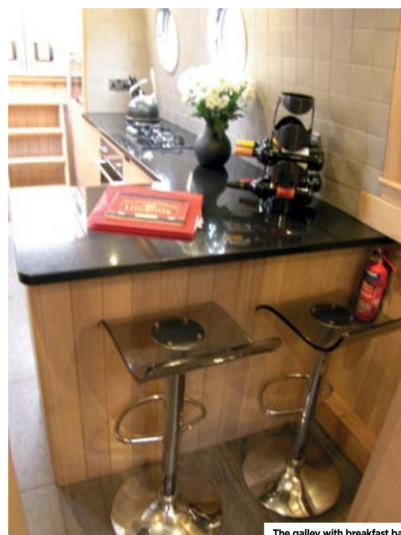
The galley with breakfast bar.

two cabins with separate bathrooms and the option of further sleeping space in the saloon. All the beds are king sized, but can also be converted into single bunks.