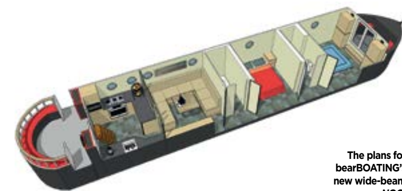
The plans for bearBOATING's new wide-beam nemoNOO .

v 07969 901383 e bearboating.co.uk m admin@bearboating.co.uk | @BearBoating f facebook.com/bearboating i @bearboating