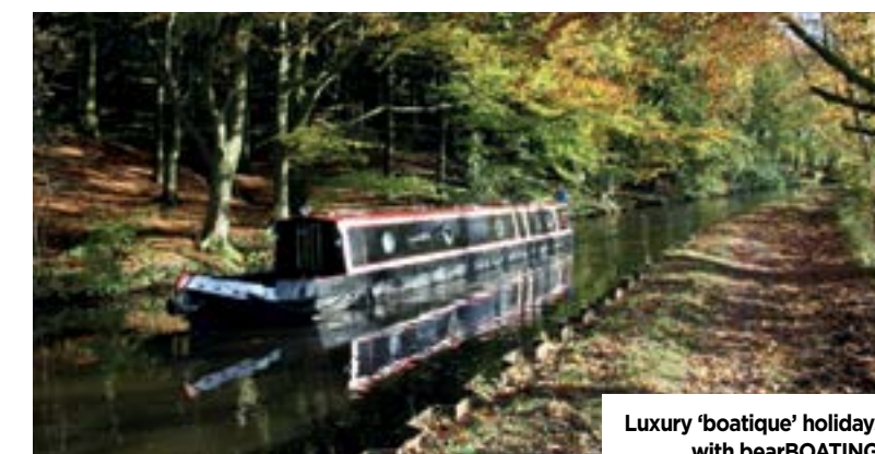
Luxury 'boatique' holidays with bearBOATING.